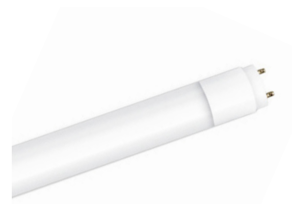
CLR245 LT. COMMERCIAL • 7YR LED DIRECT INSTALL LINEAR T8 REPLACEMENT LAMPS (PLUG AND PLAY) (UL TYPE A)