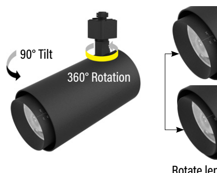
Rotate lens to adjust beam angle from 15° to 33°