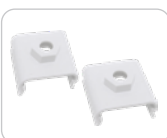
2 ea. Mounting Brackets