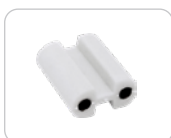
Linking Butt Connector