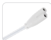
Power Cord Connector