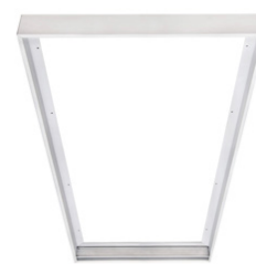
SURFACE MOUNT KIT LBSM24