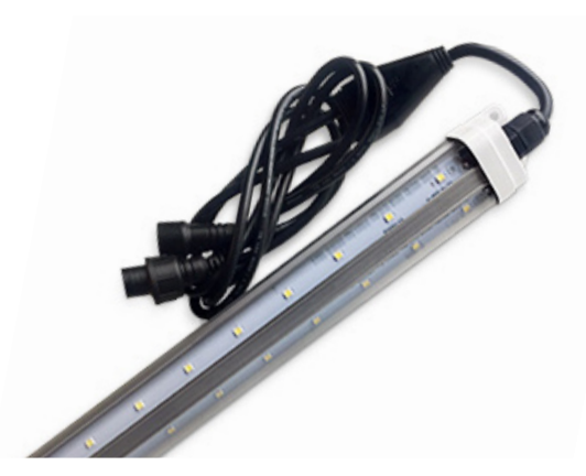
LC5204 LT. COMMERCIAL • 5YR LED COOLER LIGHTS