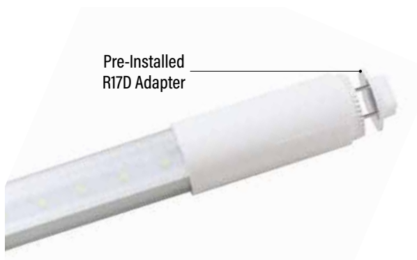
Pre-Installed R17D Adapter